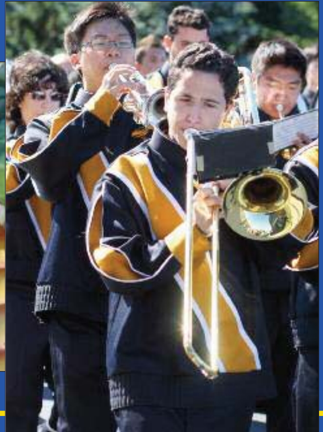
▼ The Jericho High School Flag Twirlers and Marching Band provide lively entertainment during the parade. ▲