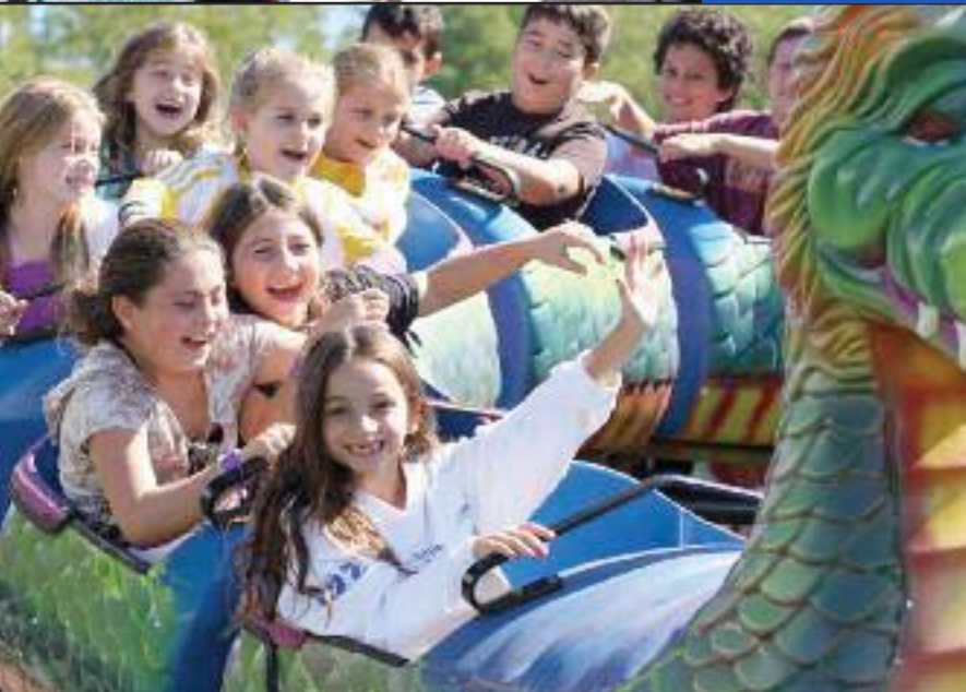
▲ The dragon roller coaster is a full of shrieking young Jericho-ites!