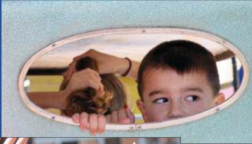
A youngster checks out the rearview of the antique car ride. ▼